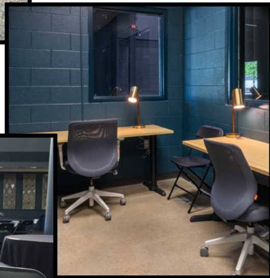
PRODUCTION OFFICES STAGE 9 PRODUCTION OFFICE