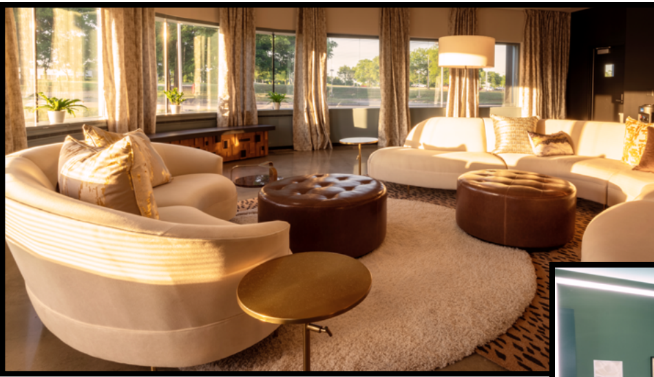
ARTIST SUITES THE ICON