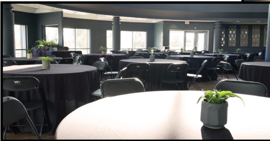
FOOD & BEVERAGE SERVICES THE ATRIUM DINING ROOM