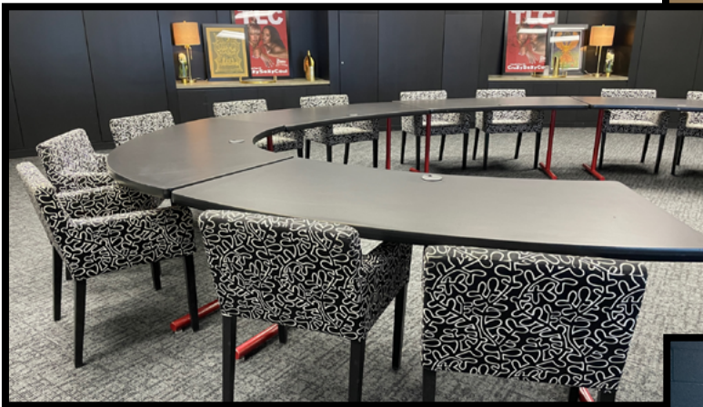
PRODUCTION SUITES PRODUCTION SUITE 5 CONFERENCE ROOM