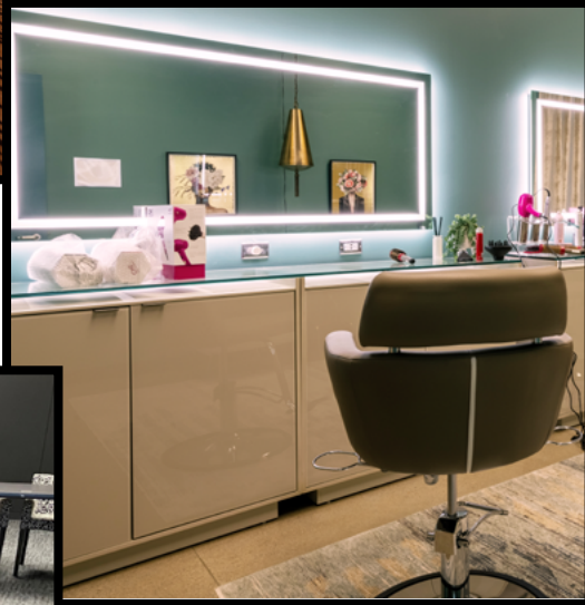
HAIR & MAKEUP THE ENCLAVE HAIR & MAKEUP ROOM